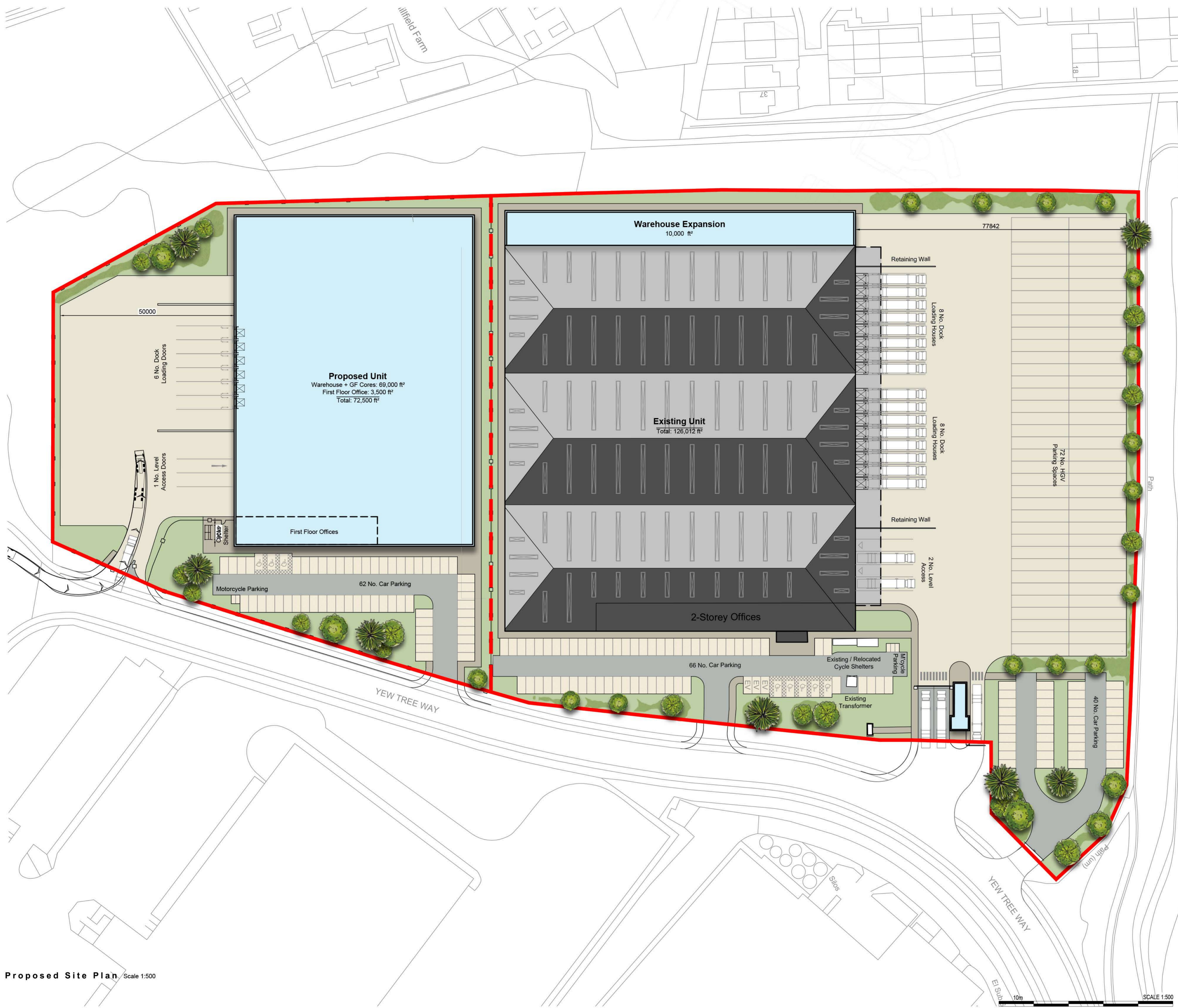
Proposed Site Plan / Scale 1:500